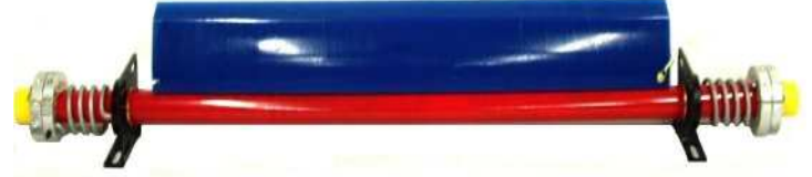
Dual Tensioner 54" - 96"