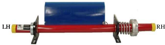
Single Tensioner 18" – 48"